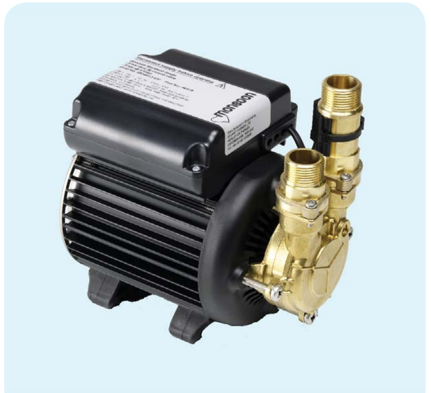
Monsoon Standard Single Pumps