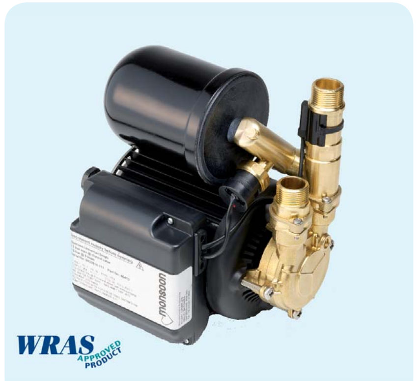
Monsoon Universal Single Pumps