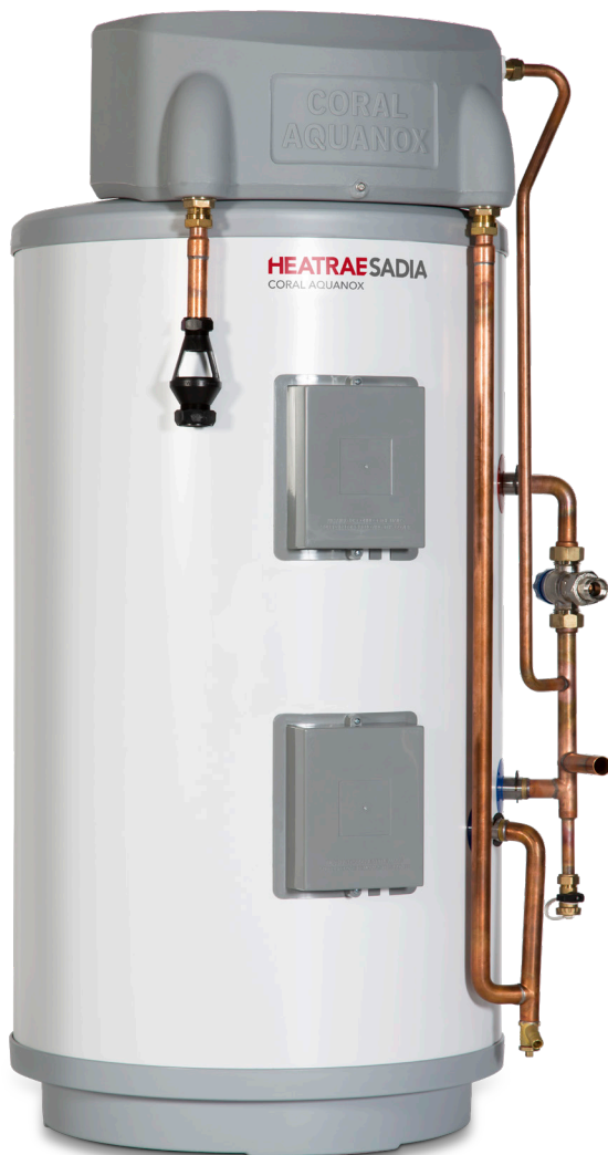
CORAL AQUANOX DIRECT