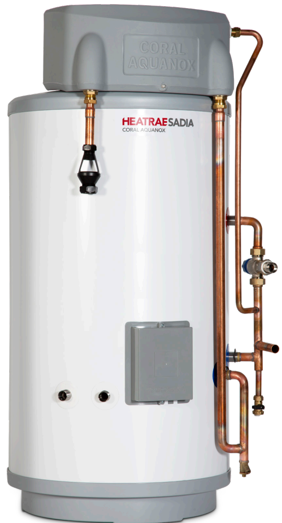
CORAL AQUANOX INDIRECT