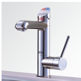
Simplifies kitchen design