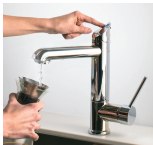
Instant boiling and chilled filtered water

Boiling and chilled filtered drinking water, instantly, PLUS hot, cold or mixed warm water – All from the one tap!