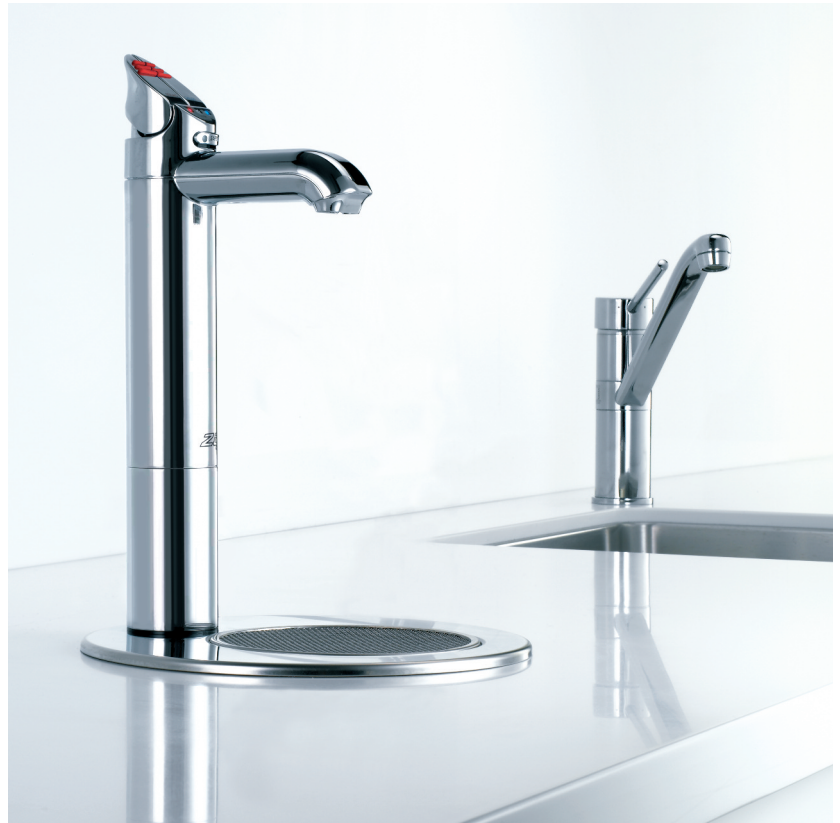
Zip HydroTap mounted on optional Tap Font; Mixer Tap included