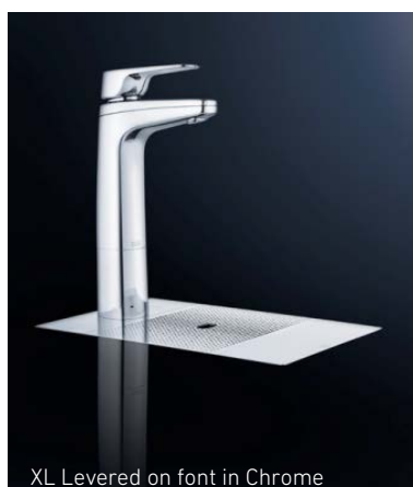
XL Levered on font in Chrome