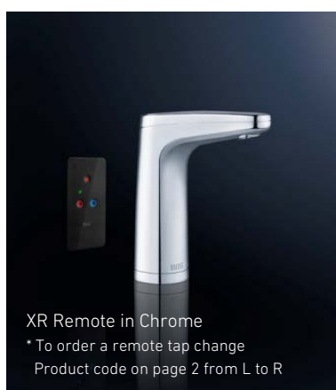
XR Remote in Chrome

* To order a touch tap change Product code on page 2 from L to T