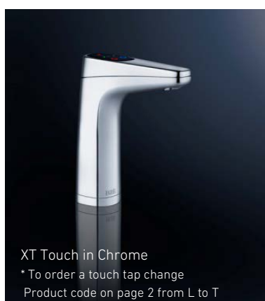
XT Touch in Chrome

* To order a touch tap change Product code on page 2 from L to T